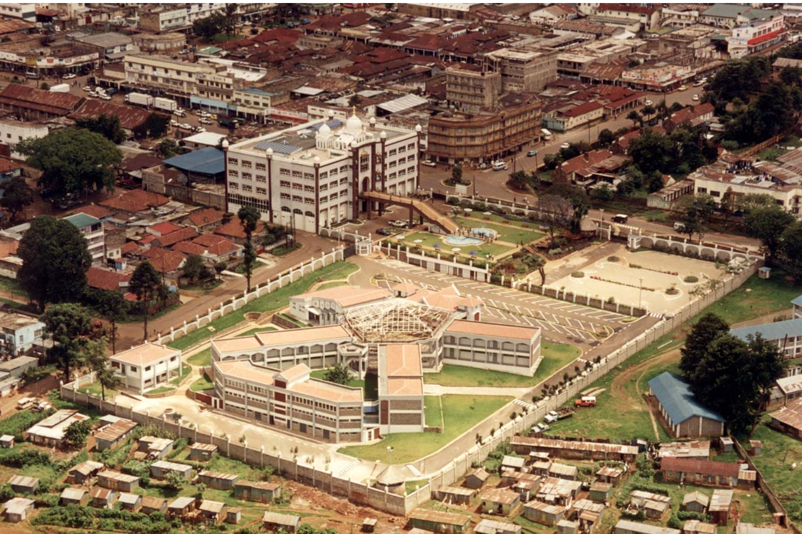
Above: Guru Nanak Nishkam Sewak Jatha (Kericho) and Nishkam Puran Institute (NPI)