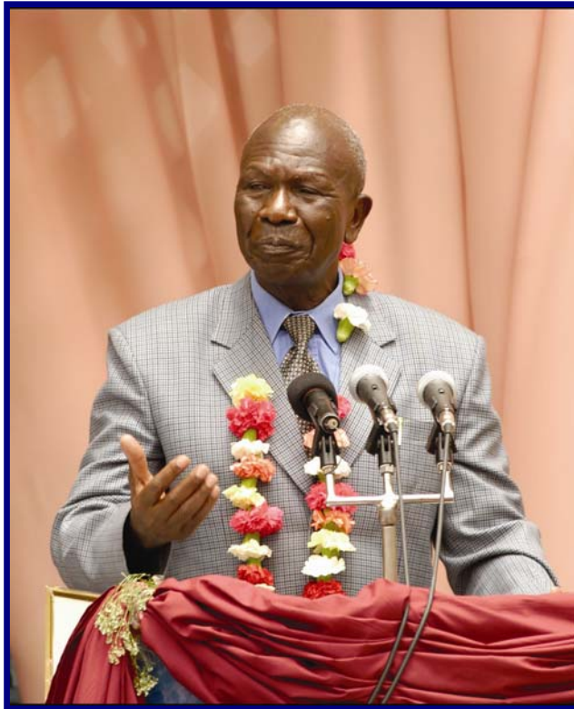
Hon. Dr. A. A. Moody Awori, EBS, M.P. Vice President and Minister for Home Affairs, Republic of Kenya